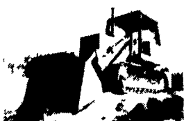
'87 CASE 1400B CRAWLER LOADER "0" Hrs. on Rebuilt Engine 80% Undercarriage, New Paint, O.R.O.P.S., Excellent $27,500