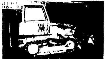
John Deere Model 1989 655B. Excellent Condition, Factory Cab & Heater, UC 90%, Tot Hrs App - 5,000 Price $55,000