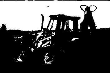
Case 580K TLB 4x4, extend-a-hoe, excellent condition.....$28,000