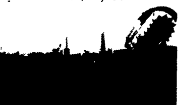
Case Trencher Model 660, Like New, Tot Hrs - 140 Price $34,000