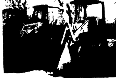
Case 450B, UA7259, 1981, ROPS, GP Bkt w/Teeth, 14"Shoe, 40% U/C..... Make Offer