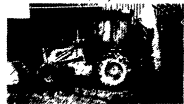
Case Backhoe 4W Drive, Model 590 with Turbo Factory Cab Heater & Radio, Like New Condition, Tot Hrs - 1,400 Price $46,500