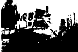
'79 DON CAT DOZER Serial #90V8647, E.R.O.P.S., S Blade w/Tilt, 60% Undercarriage, Ready to Work, Excellent $35,000