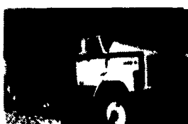
'81 GMC BRIGADIER Tri-Axle Dump, 300 Cummins, 9 Speed Fuller, 16' Steel Body, Light Wt, 26,860, Good Condition $19,000