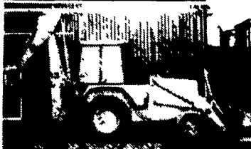
John Deere Backhoe Model 410C, Factory Cab & Heater, Excellent Condition, Tot Hrs - 32,000 Price $28,500