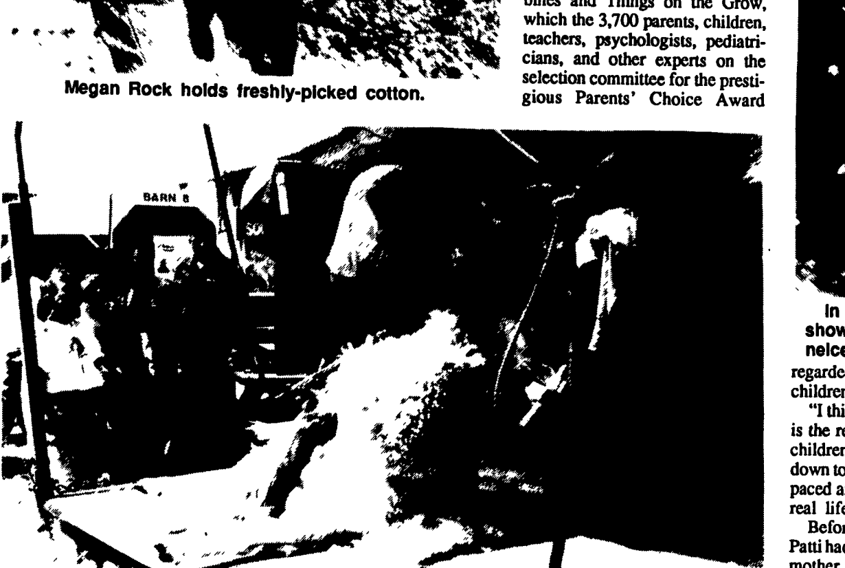
Fairgoers at Howard County Fairgrounds watch sheep shearing. Scenes like these also appear on the video.