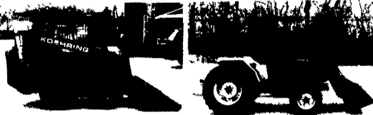
Koehring 1350 Seat Trak