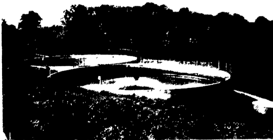
Partial In-Ground Tank Featuring Commercial Chain Link Fence (5' High - SCS approved)