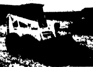
John Deere Bobcat 943 - 1990 - Low Hours, New Tires, New Paint, New Bucket, Very Nice $17,500