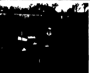
Eager Beaver Disc Chipper, JD 4 Cyl. Diesel, Hydraulic Feed Rolls, Runs Good. $6,900

NIGHTS, PHONE 717-866-7147 717-273-9089 FAX 717-866-4300