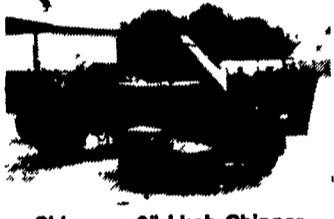
Chipmore 9" Limb Chipper, Gas, Runs Good $4,900 Have 6 Others On Stock To Choose From

WANTED: Good Late Model Construction Equipment Need S/N And Price When You Call Lease Purchase Available On Most Machines