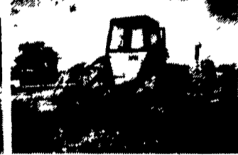
Case W14 Loader, Cab, New Paint, Runs Good $16,500