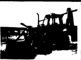
1986 Case 680K-Extendahoe, Very Clean, Only 1600 Hrs. $24,500