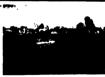
1990 JD 410C 4x4, Cab, Extendahoe, Only 2870 Hours, Very Clean $33,500