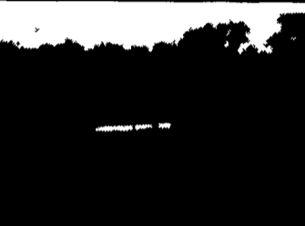
1972 Gallon 503 Series L Grader Diesel, With Scarifier, Nice Machine $13,500