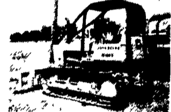
1973 JD 450B 6 Way Dozer, Excellent U/C, New Paint $12,500