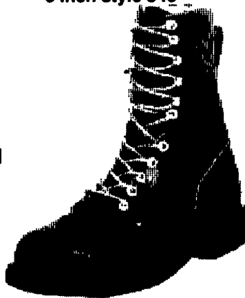
9 inch style 846