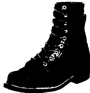
8 inch style 844

These shoes are generously sized and come with small can of mink oil.