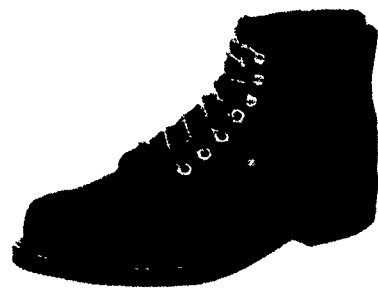
6 inch style 344

Made of rugged American horsehide leather. Horsehide is more resistant to barnyard acids, silage acids, milk, fertilizer, concrete, oil and grease.