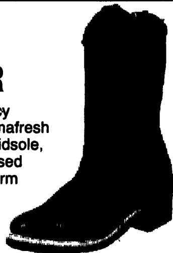
12" Western Engineer

12 inch Western Engineer boot in fancy brown full grain cowhide leather. Permafresh cushion insole, steel shank, leather midsole, long wearing oil-resistant sole with raised heel. Genuine Goodyear welt, and storm welt. Popular truck drivers boot. American Made Sizes 7-13 including 1/2 sizes.