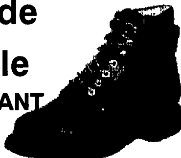
6 inch style 346

NEW HEAVY DUTY SHOE This deluxe shoe features tough long lasting HORSEHIDE LEATHER and features a rugged Marathon sole. Horsehide is the most durable, acid resistant, leather we know of. Excellent for farm use, construction use or any purpose where rugged and long wear is desired. This shoe features a one piece sole and heel construction, Genuine Goodyear welt and storm welt. Extra stitching at stress points, thick, soft padded collars made of leather, Permafresh cushion insoles and arch supports. Hooks and eyes. Steel shank. Oil resistant soles. Shoes are generously sized. Top Quality American Construction.