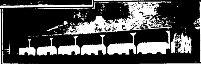
HORSE STALL BARN