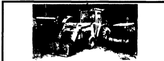
MF 20D, Diesel, 45 HP, 3 PH, PTO, Runs Well.....$6,000