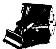
Model 1818 with Utility Snow Blade

©1995 Case Corporation Case is a registered trademark of Case Corporation 700 State Street Racine WI 53404 U.S.A.