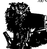
Model 1840 with Tree Spade