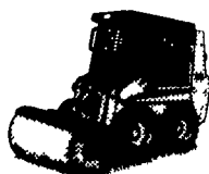
Model 1825 with Broom