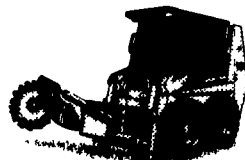
Model 1838 with Stump Grinder