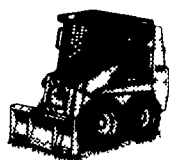
Model 1825 with 3-Point Adapter