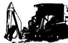
Model 1845 with Loader/Backhoe