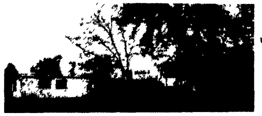
12.6 Acre Farm

1ST FLOOR FRAME DWELLING EAT-IN KITCHEN & DINING ROOM COMBINATION; LIVING ROOM; BEDROOM; SUMMER KITCHEN W/SHOWER