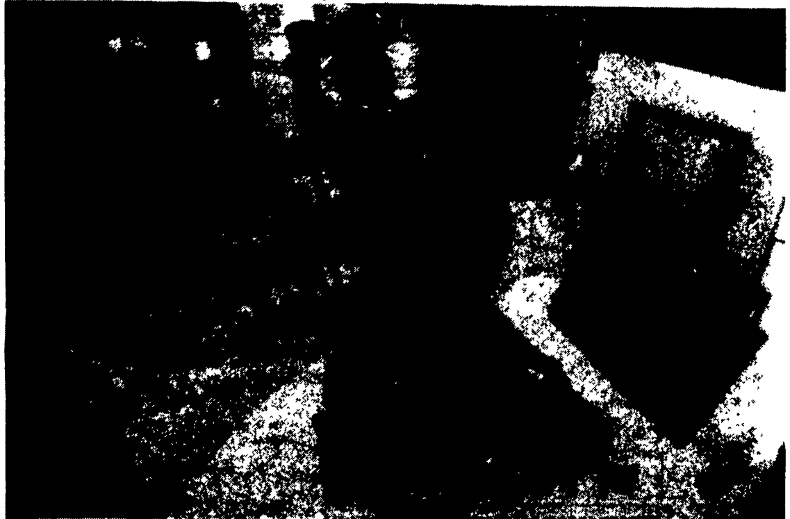
By using Verdigris and granite, these items were transformed from plain cardboard, wood, or plastic to look like granite and marble pieces.