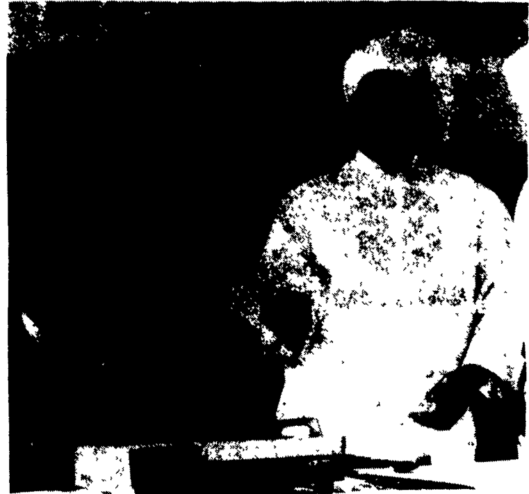
A culinary student demonstrates cooking holiday dressings for a savory addition to holiday meals.