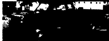
CUMMINS CLUB CAB 4x4 92 DODGE 250 This one will be gone before you know it. Turbo Diesel, AT, A/C, 48,000 Miles, Class 3 Hitch