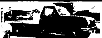
PULLING GOOSENECK 89 FORD F-350 This One's For You. Fuel Inj. 480 5 Sp., Eby Bed Gooseneck Hitch Runs Strong