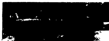
1 TON 4x4 DIESEL 89 FORD F350 Big 7.3 Diesel, 5 sp. A/C, H.D. Suspension, Tow Pkg. Excellent Body