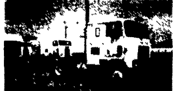
90 Intl CO9600, Cummins F300, 9 Spd., Spring Suspension, Single Axle, AC, PS, White