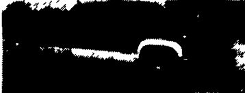
4 WHEEL DRIVE 94 CHEVY SUPER CAB DUALY The nicest - only 12,000 miles, 4:10 gears, 6.5 Turbo, Diesel, Auto, A/C, Tow Pkg.