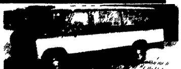
15 PASSINGER 85 FORD F-250 Plenty of Room For Everybody, V8, Auto, Frt. & Rear A/C & Heater, Ready To Travel $8,900