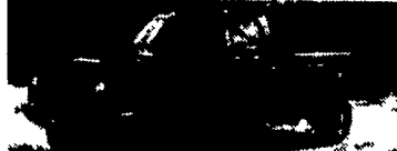
HEAVY DUTY 4x4 F250 90 FORD F250 This Trk. is Nice, Very Clean, Runs Great, 351 V8, AT, A/C, Tow Pkg., 68,000 Miles