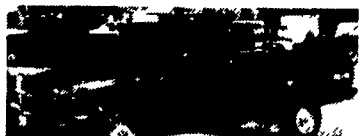
TURBO DIESEL 4X4 94 CHEVY 2500 4X4 6.5 Turbo Diesel, 5 Spd., Silverado, Loaded, Gotta See This One!