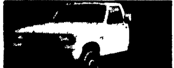
MANY POSSIBILITIES 90 FORD SUPERDUTY CHASSIS 480, 5 Spd., 137" WB, Good Condition $10,900

COMING 95 FORD SUPER DUTY STAKE BODY DUMP Powerstroke Turbo Diesel, Auto, 12 ft. Body