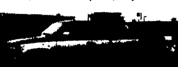
DIESEL CHEVY SUPER CAB 3 WHEEL DRIVE 89 CHEVY SILVERADO 6.5 Turbo Diesel, AT, A/C, Very Clean, Only 58,000 Miles, Two Pkg.