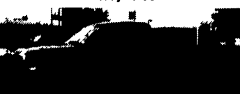
CUMMINS TURBO DIESEL 94 DODGE 2500 4x4 A Beauty, 8LT Laramie, H.D. Suspension, H.D. 6 Sp., Chrome Wheels A Real Looker