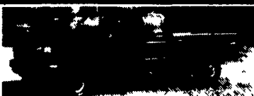
93 FORD F250 SUPER CAB 4x4 Only 42,000 Miles, H.D. Suspension, 351 V-8, Auto, A/C, Chaptain Chairs, Very Clean