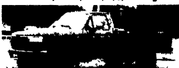
PRICED RIGHT 92 FORD F-250 4x4 Heavy Duty 3/4 Ton, 361 V8, Auto., A/C, Tow Pkg., Dual Tanks Only $14,900