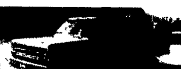
DRIVES REAL NICE 88 DODGE 150 58,000 Original Miles, 318, Auto, Power Steering & Brakes, AM-FM Cassette, Bedliner, New Insp. & Service $5,900