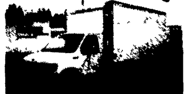
1993 Ford E350, 14' Body, 5.8 Liter, Gas, AT, 90,000 Miles, AC, PS $14,950