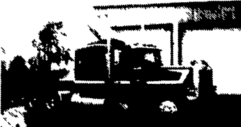
(2) 1989 Peterbilt 379, Extended Hood, 63" Slip Cummins 444; Jake 13 Spd., 12 40 Axels, 10 Alum Wheels, Red

Don't Think Of Them As Used. Think Of Them As Having Undergone Extensive Road Testing