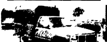
ENCLOSED UTILITY 92 GMC 3500 Nice Truck, Only 38,000 Miles, 360, V8, Auto, Ready To Go