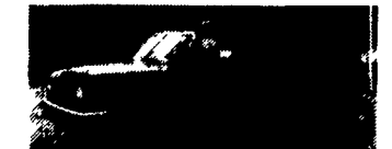
UTILITY DUMP 90 FORD SUPER DUTY 480 i.l., 5 Spd., A Truck for many uses

COMING 95 FORD SUPER DUTY STAKE BODY DUMP Powerstroke Turbo Diesel, Auto, 12 ft. Body