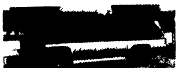
4x4 SUBURBAN 89 CHEVY 1500 SILVERADO Real Clean, Real Nice, 350 i.l., Auto, A/C, Beautiful Two Tone Paint, Tow Pkg.