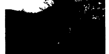
1986 Kenworth K100 S/A Trans, Cummins 300, 9 Spd., Spring Susp.