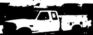
Super Cab Utility 4x4 95 Ford F-250 XL Awesome Power Stroke Turbo Diesel, Auto., A/C, Reading Utility Box, only 275 miles, New Truck Warranty