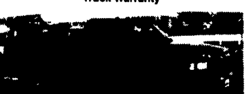
TURBO CUMMINS DIESEL 95 DODGE 2500 4x4 Like New, Only 7,700 Miles, Auto Loaded with all Options. It's Perfect.