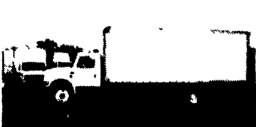
'90 & '92 Int 4700 & 4900 16'-24' Bodies, 25,500 to 33,000 GVW, w/ Lift Gates Many to Choose From