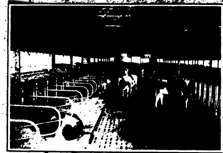
Long Core Cattle Wash