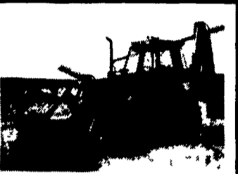
1986 Case 680K-Extendahoe, Very Clean, Only 1600 Hrs. $24,500