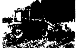
Massey Ferguson 50A Industrial Tractor Loader No. 3 Pt. or P.T.O., $4,995