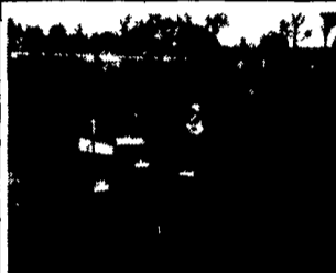
Eager Beaver Disc Chipper, JD 4 Cyl. Diesel, Hydraulic Feed Rolls, Runs Good. $6,900