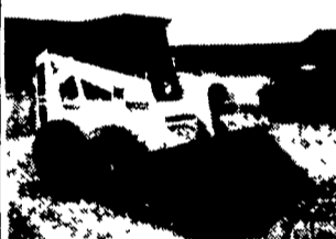
Melroe Bobcat 943 - 1990 - Low Hours, New Tires, New Paint, New Bucket, Very Nice $17,500