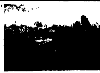
1990 JD 410C 4x4, Cab, Extendahoe, Only 2870 Hours, Very Clean $33,500