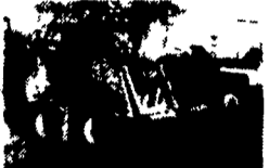
Case 1845 Diesel one owner, good condition