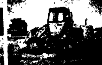
Case W14 Loader, Cab, New Paint, Runs Good $16,500