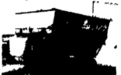
Knight Bigg Auggie 12 280 cu. ft.