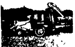
Case 580E Loader Backhoe 4WD/Cab/Extendahoe