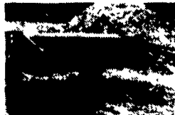
Gehl 2170 Mower-Conditioner, 9'3" cut, $7,795 w/0% Financing