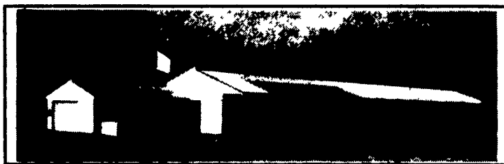
HEIFER AND CALF RAISING FACILITY