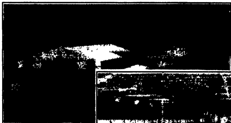
DAIRY COMPLEX Exterior & Interior