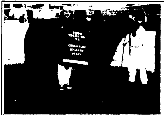
Grand Champion Market Steer The Annex Florist