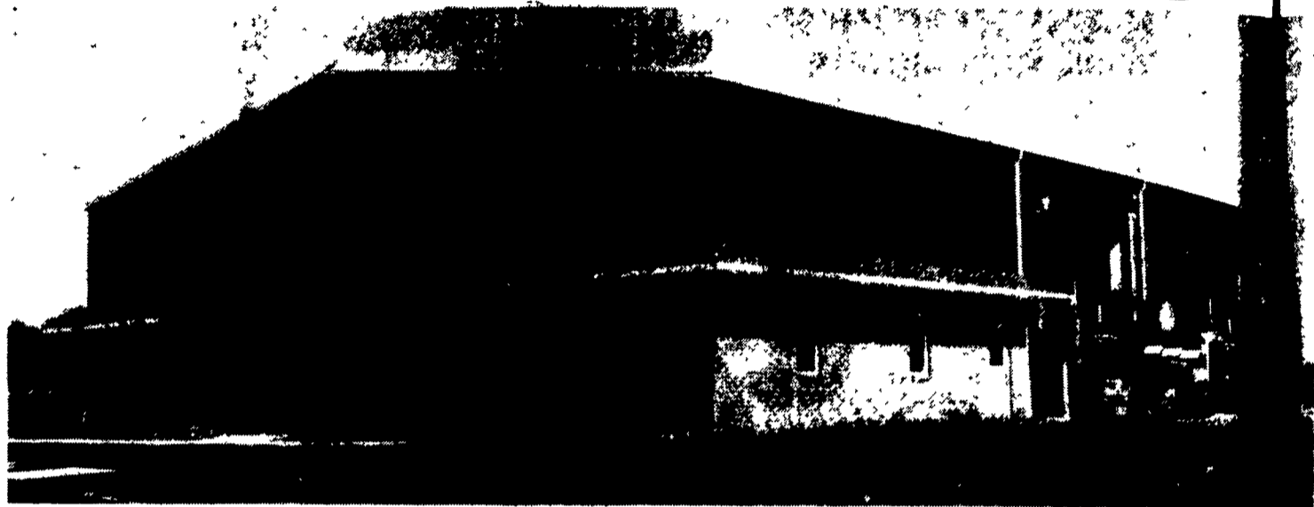
Facility Located Just West of Mount Joy Along Route 230

Thursday, November 2nd, 11 A.M. - 4 P.M. All New Office & Truck Housing Facility