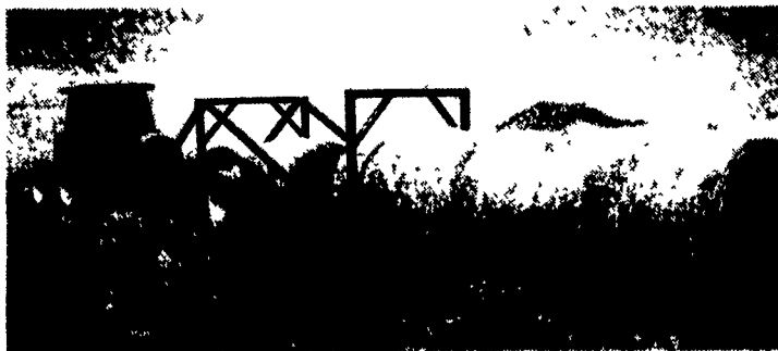
6 Bale Unit