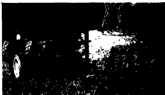
4 Bale Unit