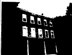
Unique Spring House

Location: 14 miles south of Sunbury, PA. 1 mile east of Herndon and Route 147, Northumberland County.