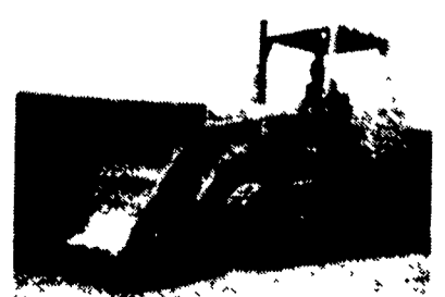
JD 755 rebuilt motor 75% U.C $19,000