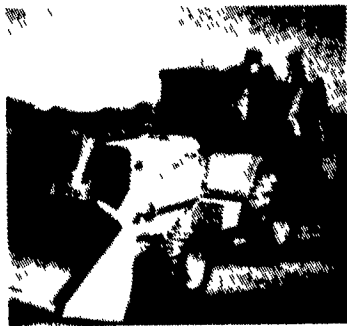
JD 410B, 4WD, Extend-A-Hoe, Good Rubber.....$21,000