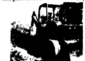
JD 450C Crawler Loader w/Backhoe, Good Cond .....$14,000