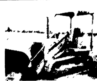
1987 Cat 935B, One Owner, 2100 Original Hours, Original Paint, Good Condition..... $24,000