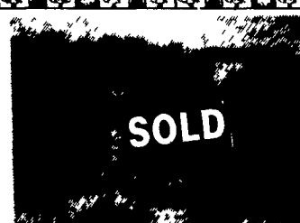
Case 1450, 80% U/N, 2 1/4 Yd. Bucket w/Teeth.....$14,000