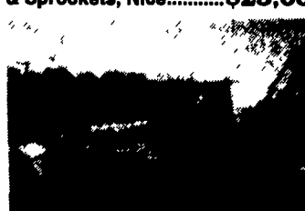
87 JD 510C Turbo, Cab, Good Rubber.....$21,000