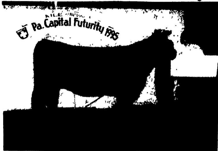
Simmental Futurity senior grand champion heifer owned by Lenzer Farms, Sewickly. Shown are Lee Snyder and Ginger Woolcock.

In all, there were a total of 13 exhibitors. In the junior contests, there were a total of 20 heifers and eight bulls at the start of the contest. In the senior competition, there were a total of four heifers and one bull.