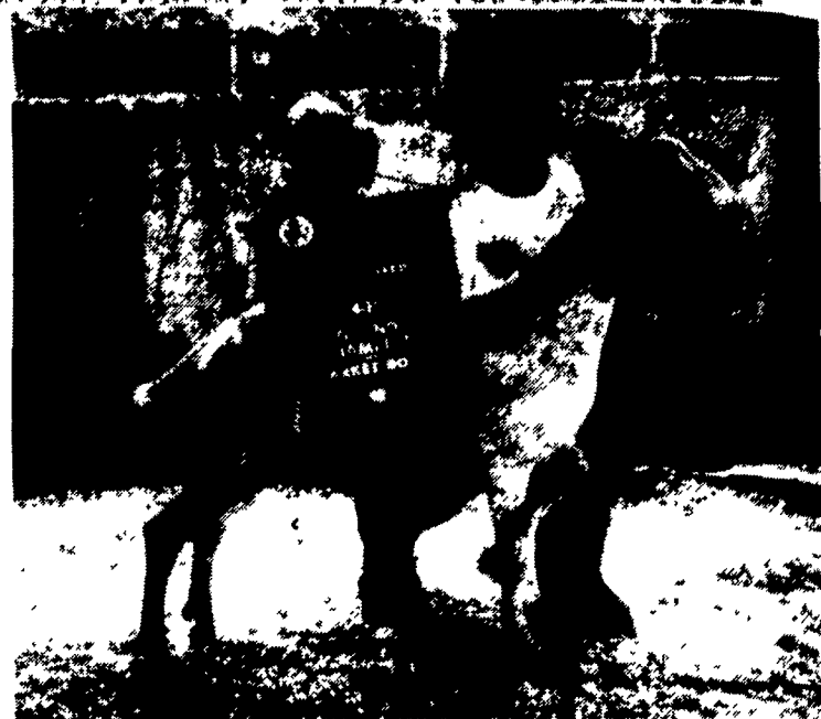
The grand champion market goat in Montgomery County was shown by Isaac Garges.