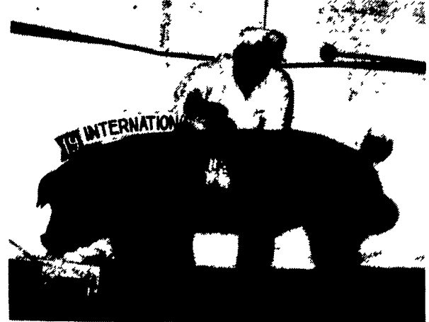
Duroc breeding swine champion boar, owned and shown by Howard Parrish.