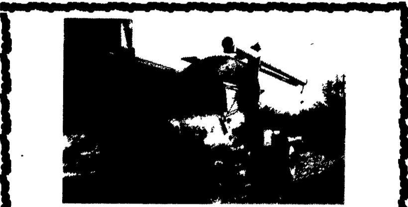
Ford Feed Truck, Auger & Blower, Tank and Equipment, Good Condition, Truck Fair Condition $5,000

'91 Ford F150, 4x4, 300 EFI, 5 spd, PS, PB, AM-FM, dual tanks, 6,250 GVW, 19,000 original miles, excellent condition, $11,995. 717-733-2873