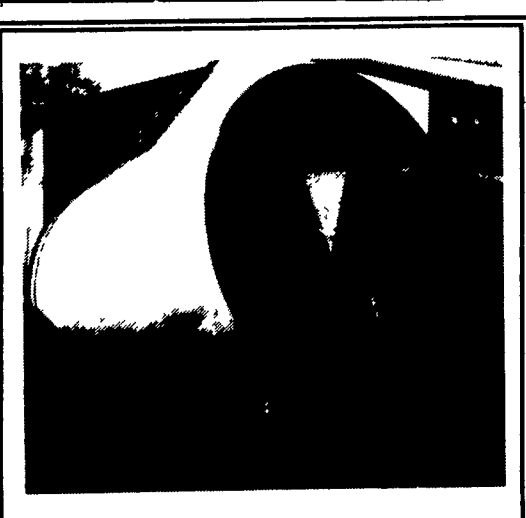
Used FARMMASTER Model 190 Mixer (now sold as Model 317)

....with stainless steel sides ....comes with new discharge auger ....has electronic scales