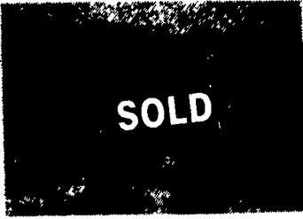
Case 1450, 80% U/W, 2 1/4 Yd. Bucket w/Teeth.....$14,000