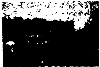
87 JD 510C Turbo, Cab, Good Rubber.....$21,000