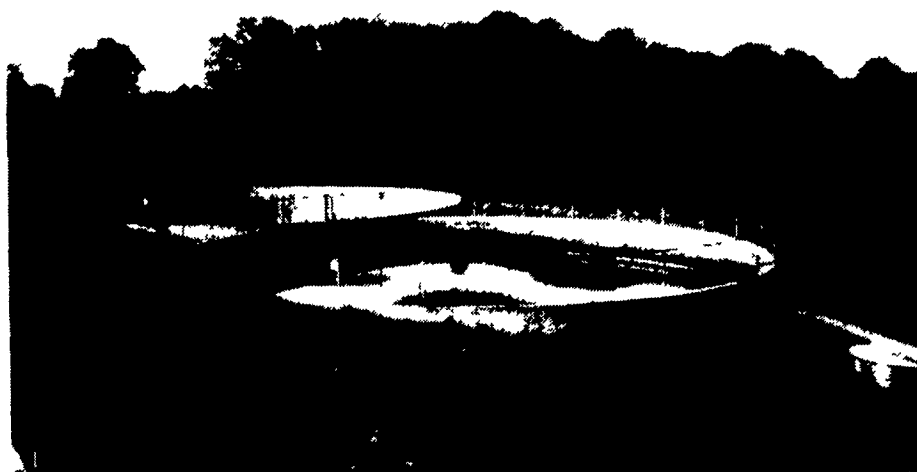
Partial In-Ground Tank Featuring Commercial Chain Link Fence (5' High - SCS approved)