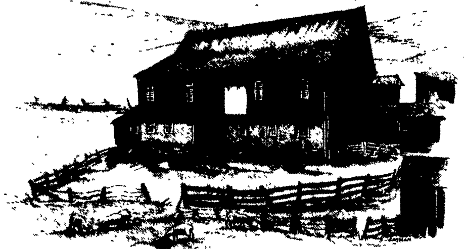
Several Bedford County farms inspired paintings such as these.