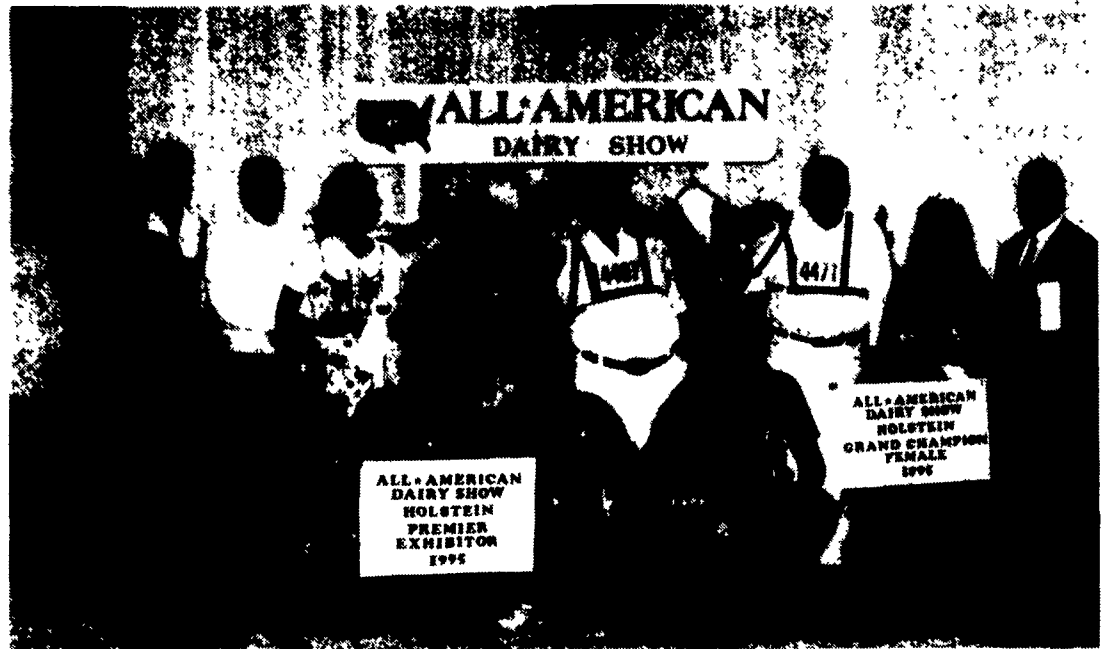
In the Eastern National Holstein Show, the premier exhibitor was Pamtom Farm, Hudson Falls, N.Y. The grand champion female was also shown by Pamtom Farm.