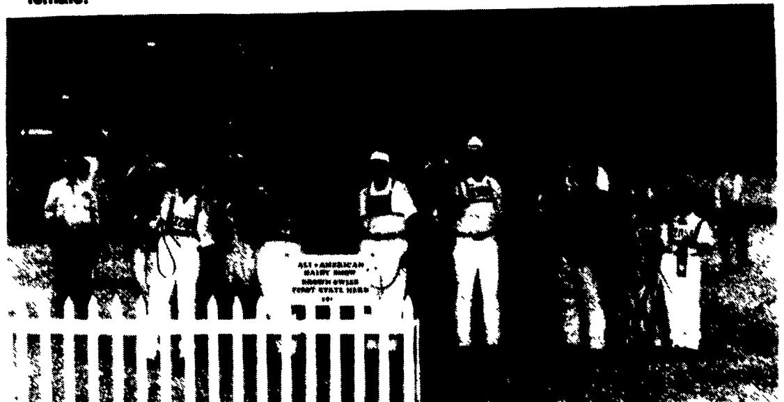
Eastern National Brown Swiss Show state herd winner was Maryland by the Maryland Brown Swiss Association, Hollywood, Md.