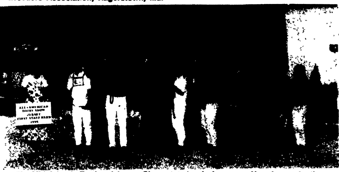
The Mid-Atlantic Regional Jersey Show state herd winner was New Jersey, by the New Jersey Jersey Cattle Association, Southampton, NJ.