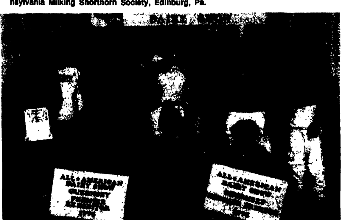
in the National Guernsey Show, both the premier breeder and premier exhibitor awards went to Snider Homestead FArm, New Enterprise, Pa.