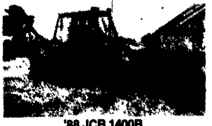
'88 JCB 1400B $15,000