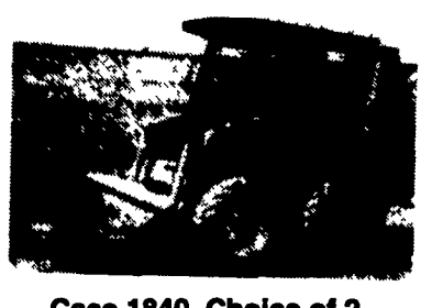
Case 1840, Choice of 2 $11,500