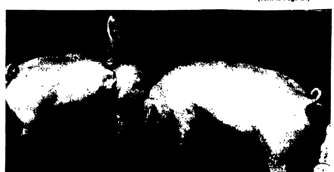
Reading Fair awine pair champion was Cathryn Levan.

champion pair of hogs at Reading, is in the 6th grade at Hamburg (Turn to Page D7)