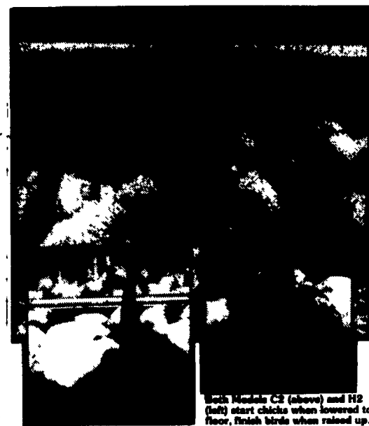
Both Models C2 (above) and H2 (left) start chicks when lowered to floor, finish birds when raised up.