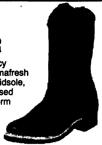
12" Western Engineer $81.95

American Made Sizes 7-13 including 1/2 sizes.