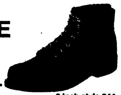
6 Inch style 344

Made of rugged American horsehide leather. Horsehide is more resistant to barnyard acids, silage acids, milk, fertilizer, concrete, oil and grease.