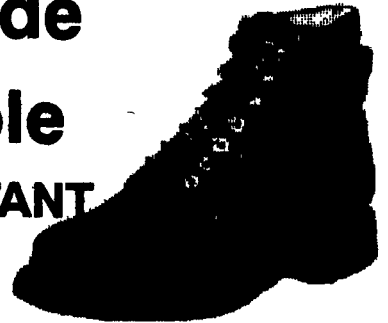
6 Inch style 346

NEW HEAVY DUTY SHOE This deluxe shoe features tough long lasting HORSEHIDE LEATHER and features a rugged Marathon sole. Horsehide is the most durable, acid resistant, leather we know of. Excellent for farm use, construction use or any purpose where rugged and long wear is desired. This shoe features a one piece sole and heel construction, Genuine Goodyear welt and storm welt. Extra stitching at stress points, thick, soft padded collars made of leather, Permafresh cushion insoles and arch supports. Hooks and eyes. Steel shank. Oil resistant soles. Shoes are generously sized. Top Quality American Construction.