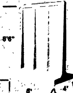
Quick Erect Bunker Silo Sections