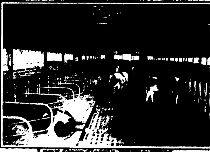
Long Core Casts Bunker Silos