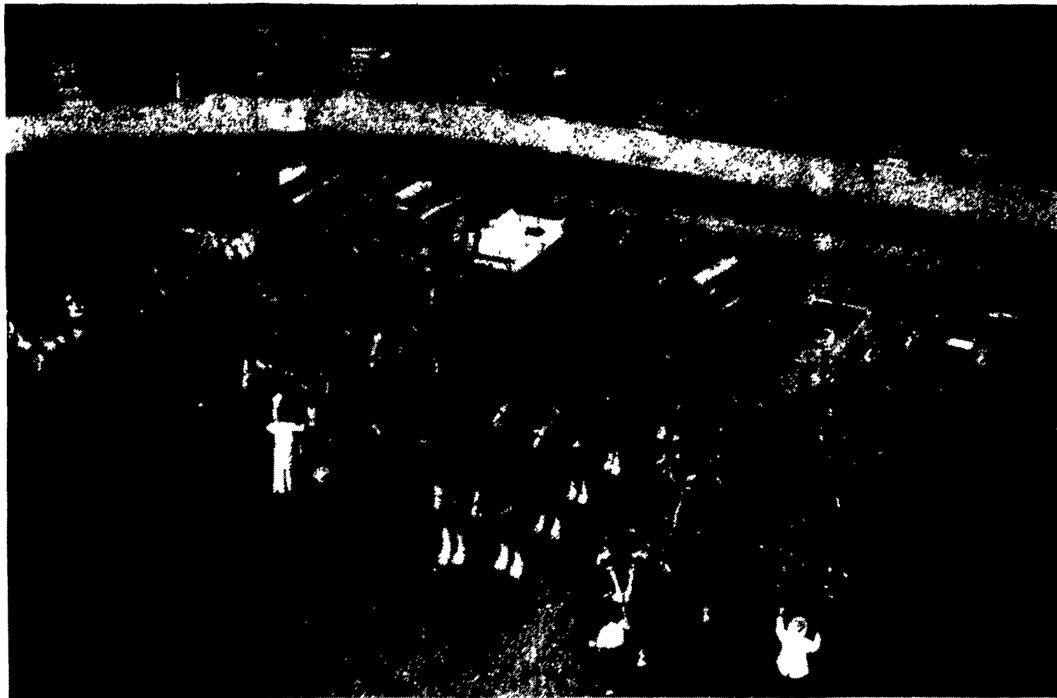
The Heavy Hitch Classic will begin at 7:00 p.m. in the large arena on Saturday, October 7.

On Saturday, October 7th, the Farm Show Arena will come alive with the sound of thundering hooves. The Heavy Hitch Classic will begin at 7:00 p.m. in the Large Arena of the Farm Show Complex. An admission fee of $5.00 per person will be charged at the gate.