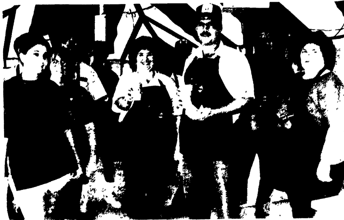
Serving scrumptious milkshakes, ice cream and other dairy favorites at the Solanco Fair are these volunteers.