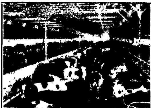
Free Stall Barn Interior