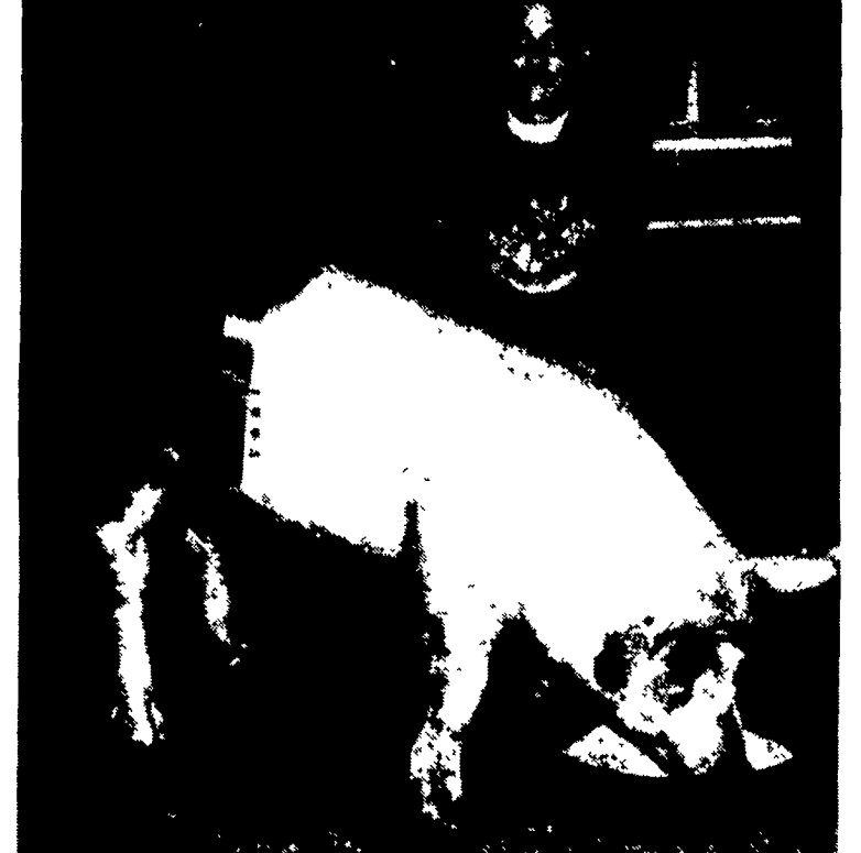
After 10 years of showing hogs, Tracy Bollinger captures the grand champion market trophy at the Ephrata Swine Show.

RESERVE CHAMPION - Virginia Nolt, Reinholds