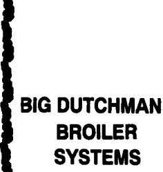
BIG DUTCHMAN BROILER SYSTEMS