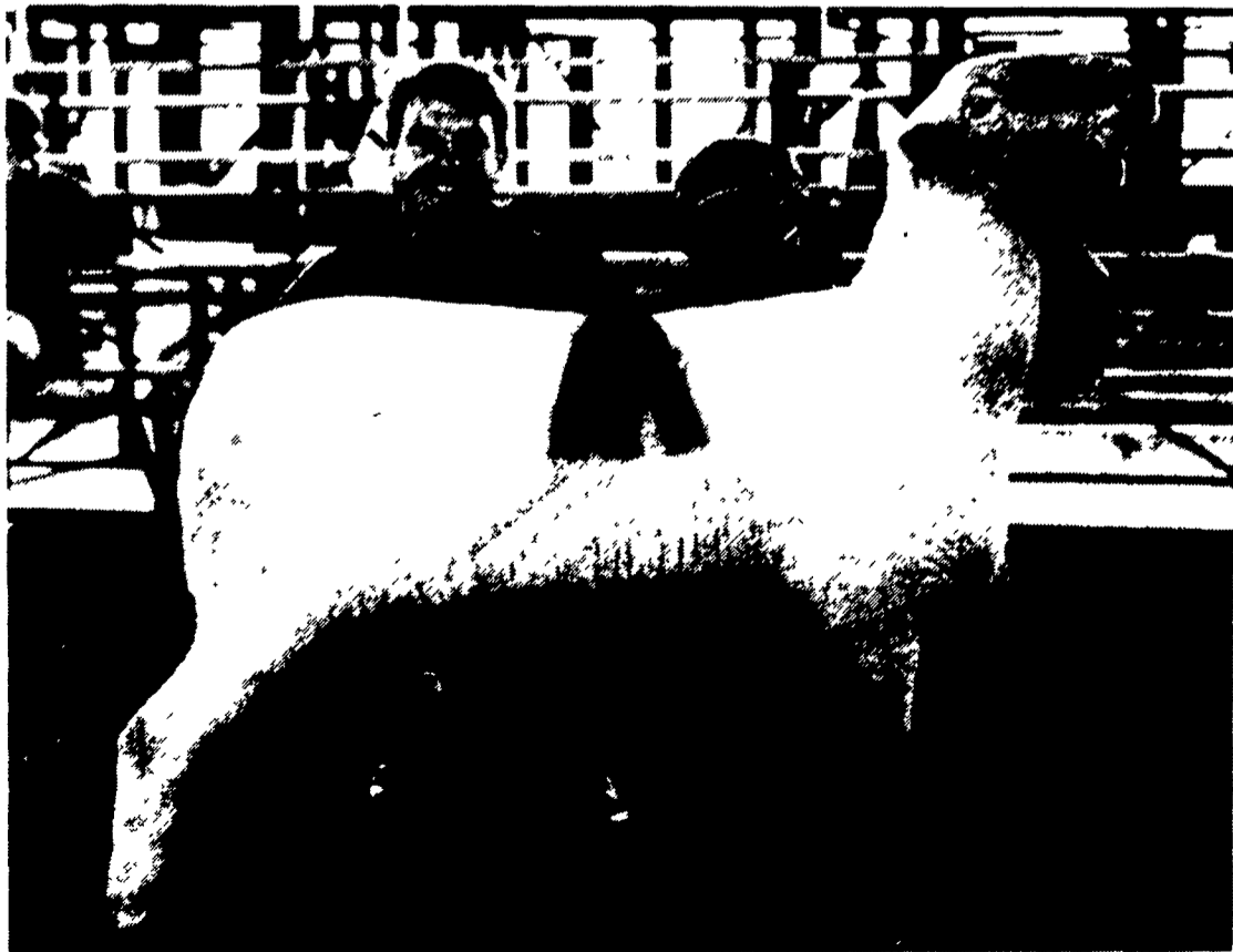
Bruce Snyder, right, won grand champion ram at the Reading Fair. At left is David Lytle, show judge.

Because of the expense involved, the Blue Ribbon Panel found that animal waste storage structures, which can range from a concrete-lined lagoon to a roofed or covered structure, were being cost-shared at a level substantially lower than other agricultural best management practices.