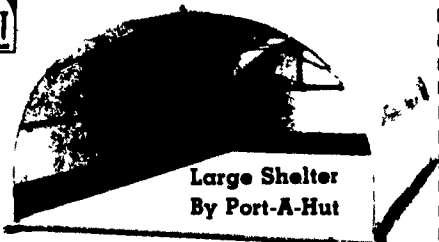
Large Shelter By Port-A-Hut