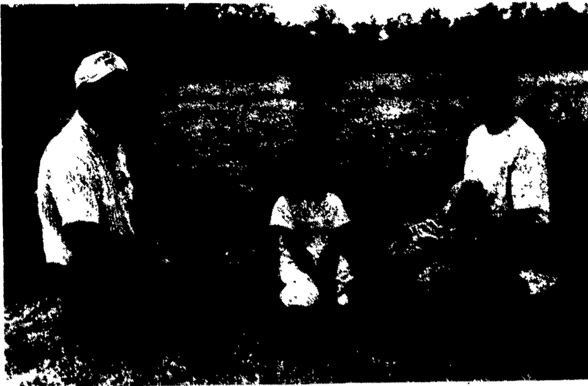
The Freys enjoy relaxing outside where they are surrounded by acres of pasture for the purebred Angus cattle, which the Freys raise.