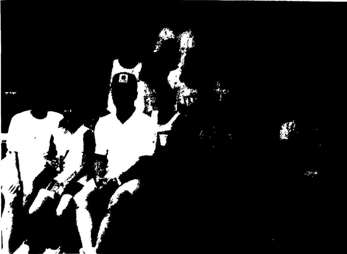
During a week-long summer exchange program, new friends from Gradiot County, Michigan, visited Mifflin County. Members of the Mifflin County Junlor Leaders Club plan to reciprocate next year with a trip out west.