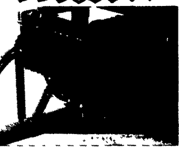
Weight Transfer is needed on some fields for best mulching results. Unique Farmhand system allows weight to be distributed between the front and rear rollers and the draw bar as needed.

Tough. Reliable. Heavyduty features you can count on. Stop in. Check out a CultiMulcher from Farmhand.