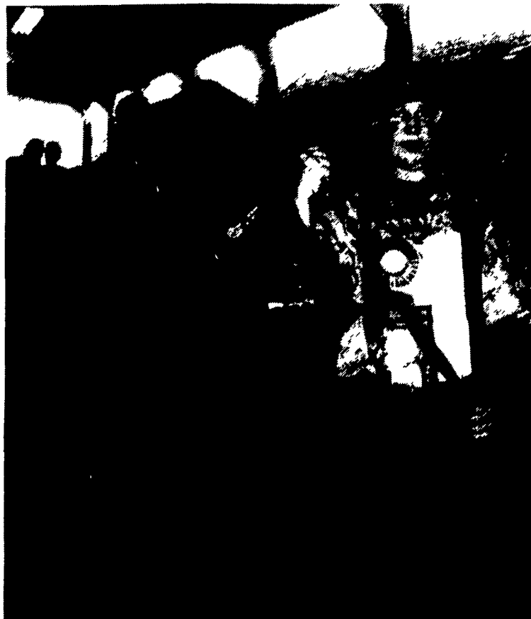
The reserve supreme champion market steer is shown by Herman Hake.