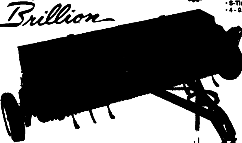
SS10 GRASS SEEDER