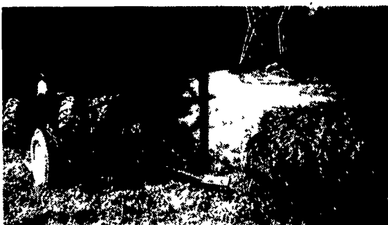
4 Bale Unit