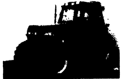
Case IH 2096, 4,202 Hrs. $21,500.00