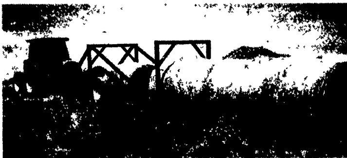
6 Bale Unit